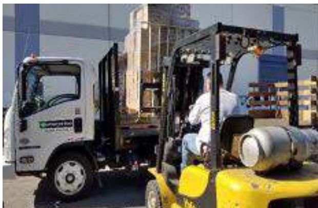
The food being loaded at CAP

This experiment worked very well so the Food Committee will be discussing the benefits of continuing to pick up the food from CAP this way every month.