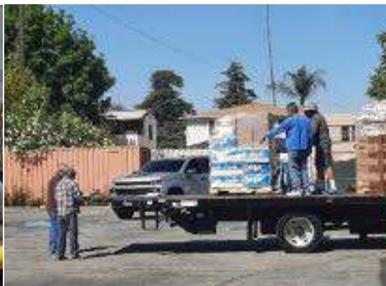
Unloading the food with our pallet jack