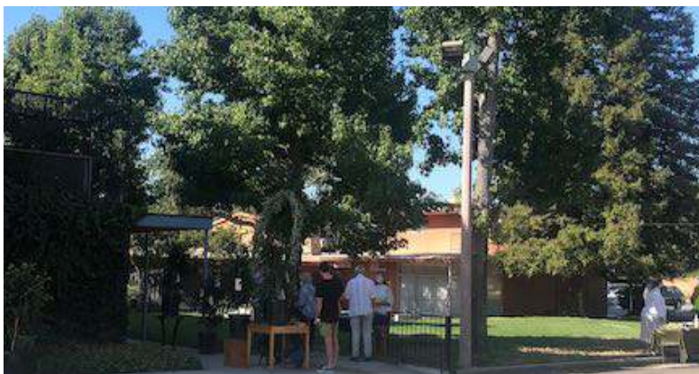
Threshold Event as we commenced our Sabbath Season. If you couldn't make the event, you will receive a packet.

"Clergy Renewal Programs provide an opportunity for pastors to step away briefly from the persistent obligations of daily parish life and to engage in a period of renewal and reflection. Renewal periods are not vacations but times for intentional exploration and reflection , for drinking again from God's life-giving waters, for regaining enthusiasm and creativity for ministry."