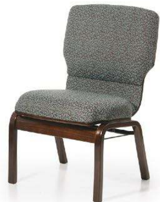
This is a version of the chair the committee is considering. The fabric and finish will be different.

The committee that is working on when and how we will gather on the church campus is working hard. They have developed a safe practices manual for various ministries that continue to happen on the church grounds. They are monitoring conditions and planning how we will gather for worship when it is safe for us to do so. Meanwhile, we continue to worship online and hold one another in prayer.