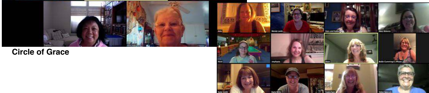
Circle of Grace