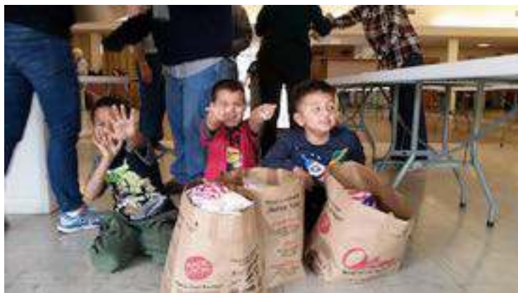
The Childcare Center children helped prepare food bags.