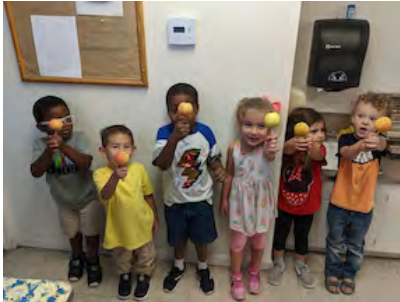
Making Carmel apples for snack-posted 9/20/19