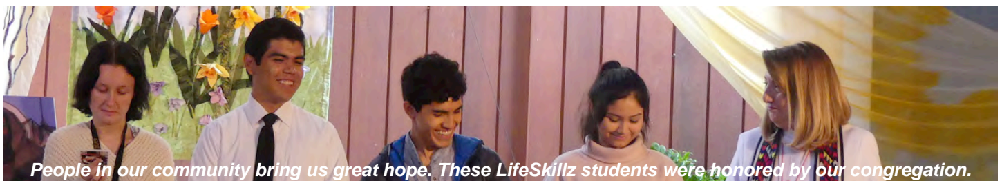
People in our community bring us great hope. These LifeSkillz students were honored by our congregation.